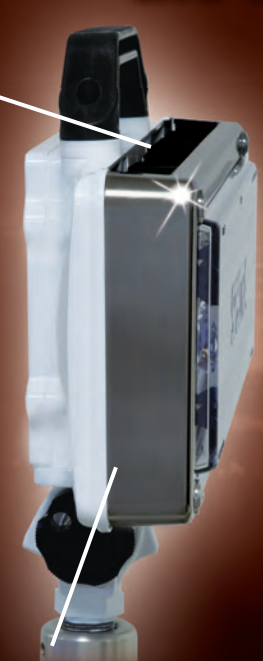
Slimmest lamphead profile

Higher Lumens with Unique cooling fins design