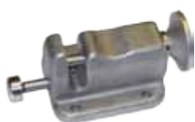
Dual Quick Release Bracket (The lock can be released from either side.)