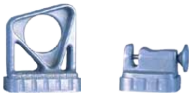
Quick Release Bracket Set (Shown with Focus lamphead spacers.)