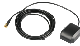
External GPS Receiver