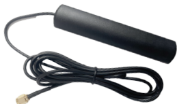
External Wi-Fi Antenna