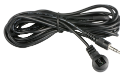
External IR Sensor