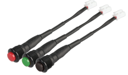
Push Button Screen View Controls

www.fireresearch.com 631.724.8888 sales@fireresearch.com