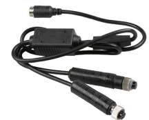
Standard Definition Splitter Cable (If Needed)